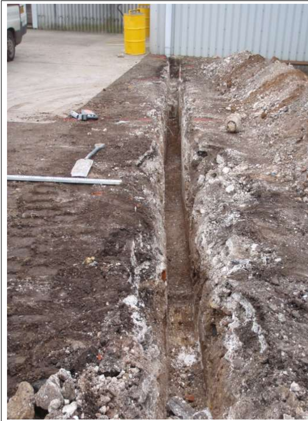
Plate 1. Cable run trench to the main grid hook-up (looking north)