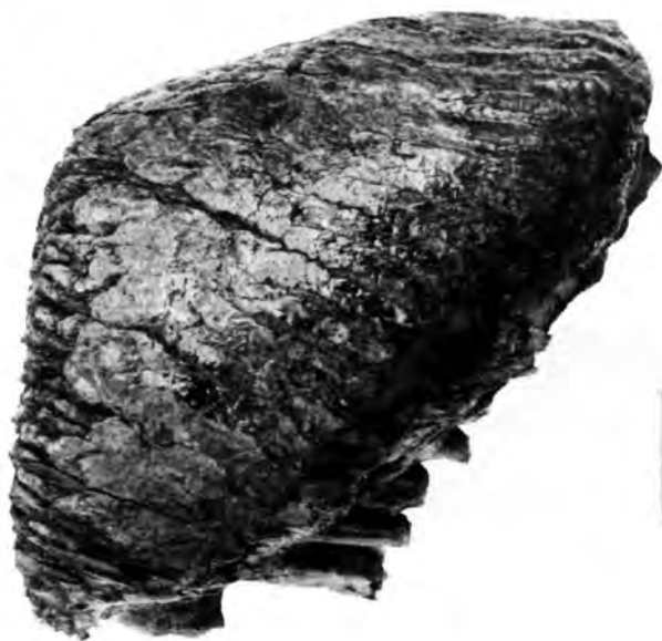
Mammuthus primigenius Intact adult Molar (HZM 1.8360). Scale = 5 cm.