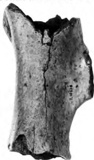
Coelodonta antiquitatis Femur Shaft (HZM 2.10528). Scale = cm. and mm.