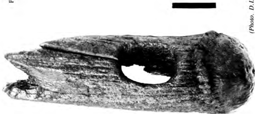
PLATE III B