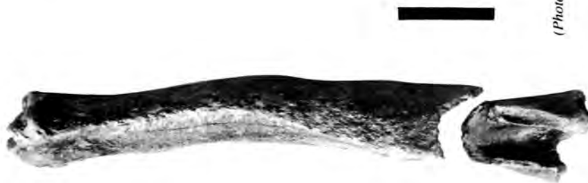
PLATE III A