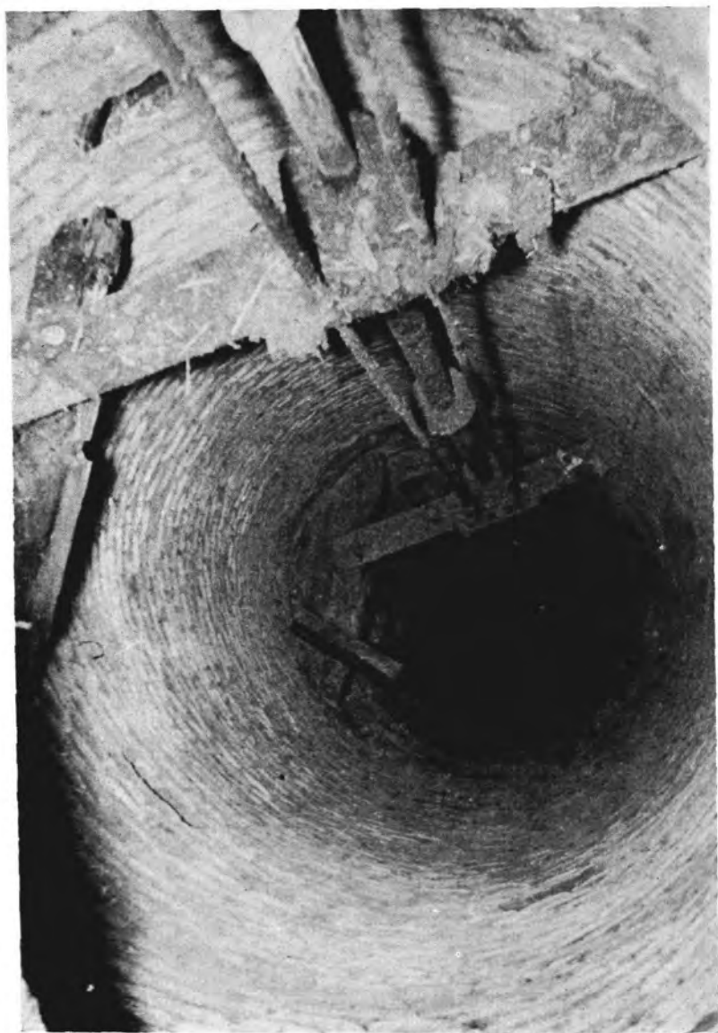
View down the Well.