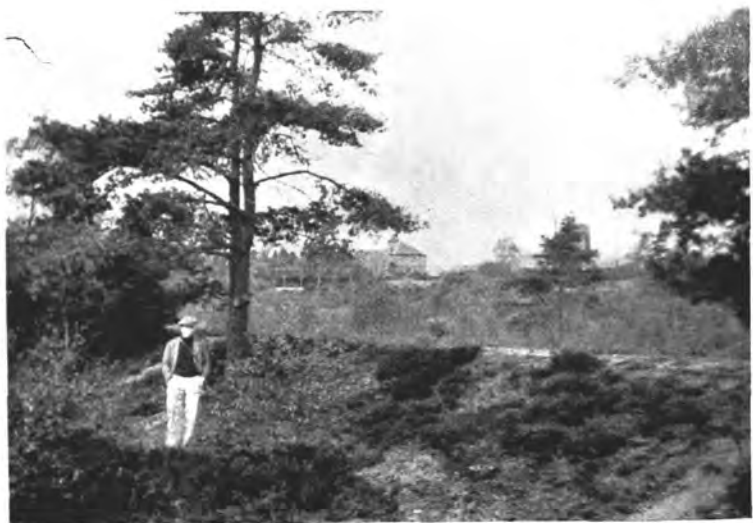
EARTHWORK ON KESTON COMMON.