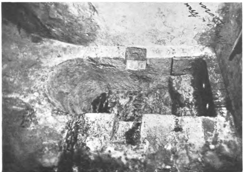
PLATE II. THE RECESS IN THE WELL ROOM. Showing the holes which led to the discovery of the pipes.