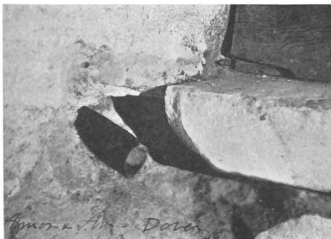
PLATE IV. THE PIPE IN THE CONDUIT UNDER THE STEPS.