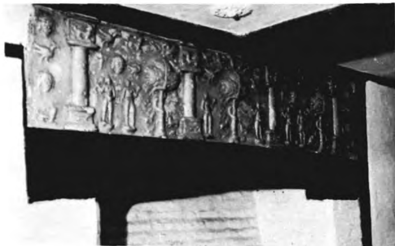
B. The Overmantel of the central Bedroom.