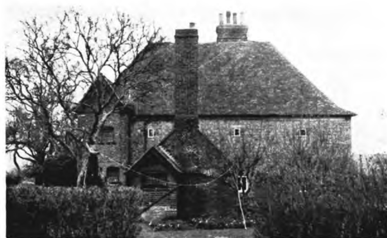
B. The South Side, fortified against Napoleon.