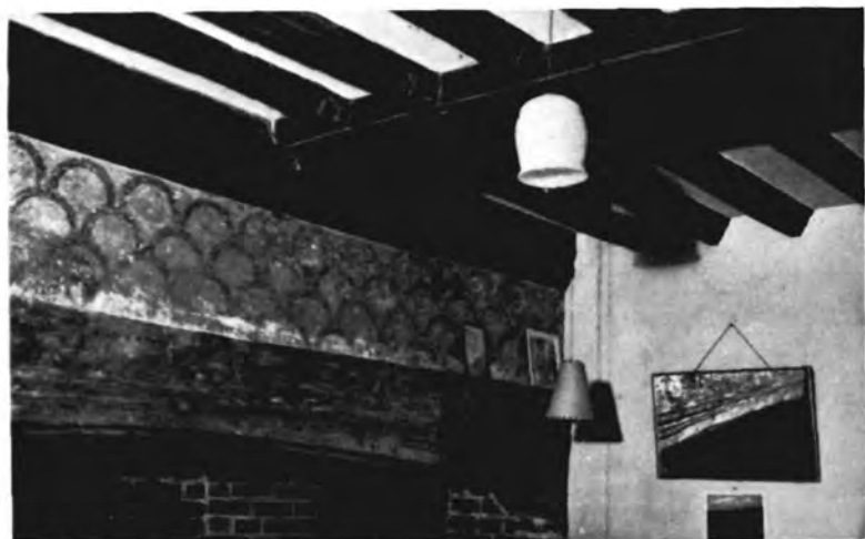
A. The great Fireplace with Wall-Painting.