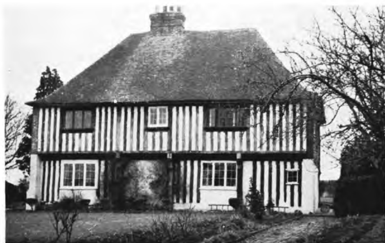
A. Cobb's Hall, the North Front.