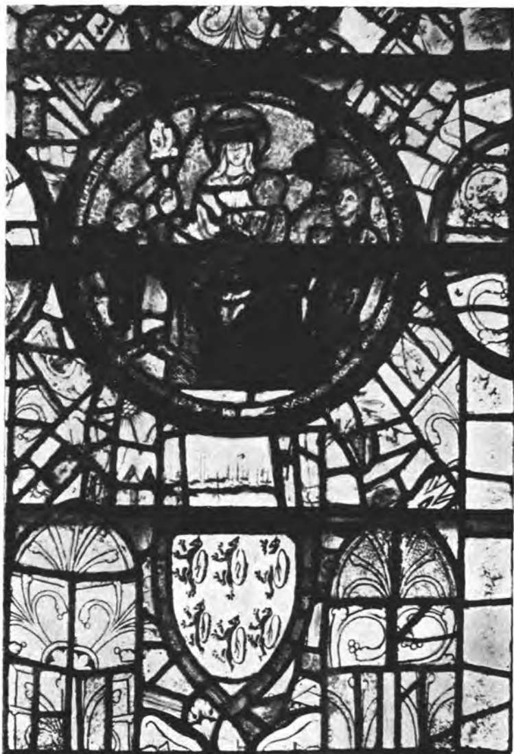
THE VIRGIN ENTHRONED.