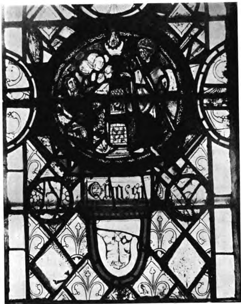
ST. NICHOLAS AND THE THREE MAIDENS.