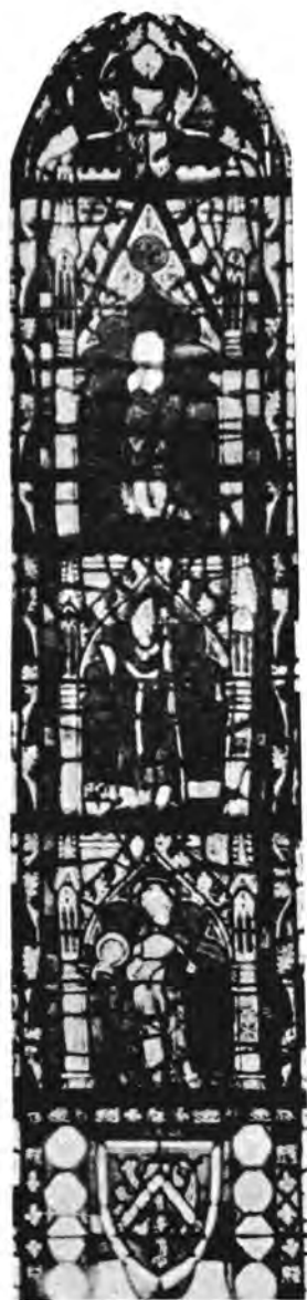
SOUTH LANCET OF THE EAST WINDOW.