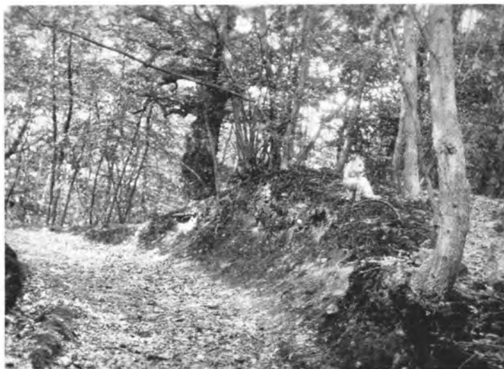
PLATE III. Section through Rampart on west side of Hill Fort.