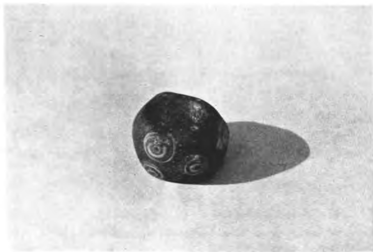
PLATE IV. Bead of 200-100 B.C. found near Rampart.