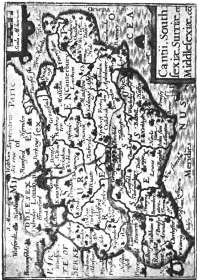
PLATE II. PETER KEER'S MAP OF KENT, SUSSEX, SURREY AND MIDDLESEX, 1599.