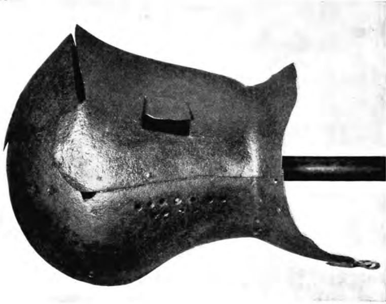
XVI CENT. TOURNAMENT HELM IN LULLINGSTONE CHURCH.