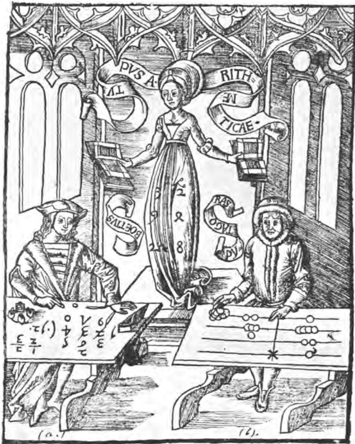
THE REISCH ABACUS.