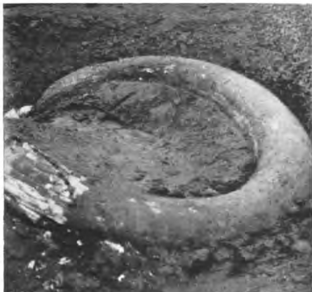
MAMMOTH TUSK DISCOVERED AT SITTINGBOURNE.