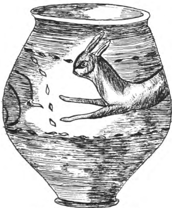
A ROMAN POT FROM OTFORD.