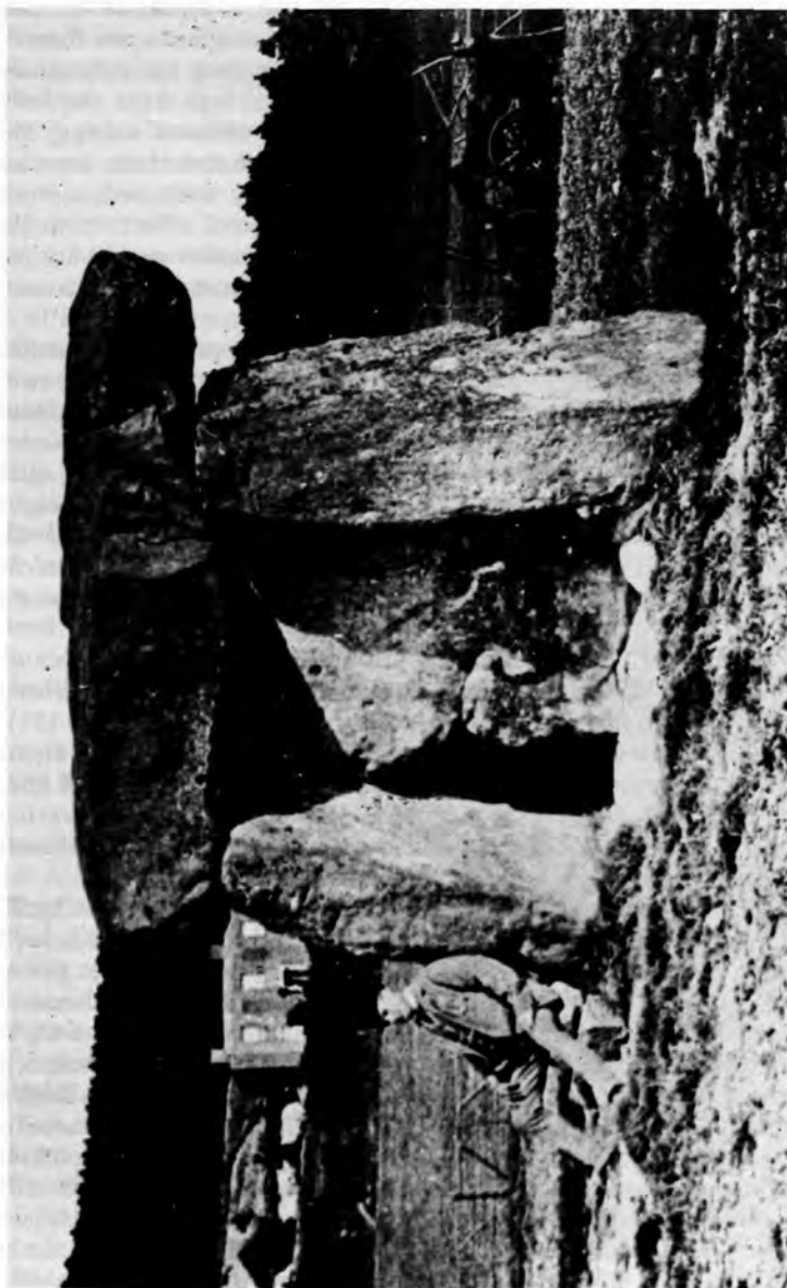
Kit's Coty House, from the south-west, before the erection of the iron railings in 1885